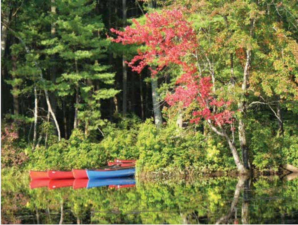
Canoes on Squannacook River.

Directions to and descriptions of these launch sites can be found in the NRWA Canoe and Kayak Guide. [See: www.NashuaRiverWatershed.org/Recreation/Paddling ]. View launch locations and directions on Google map: www.google.com/maps/d/viewer?mid=14jIr9h4POKSFESqlGeqwnswU8M0&ll=42.583252250551965%2C-71.71002070263063&z=10